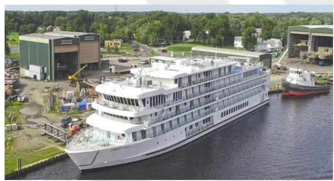
Chesapeake's shipyard in Salisbury, Maryland.

We were pleased to assist Chesapeake Shipbuilding in the company's continued growth and expansion. The company announced the addition of a hundred new jobs over the next several years.