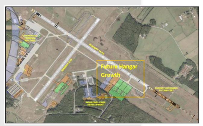
Establishing shovel-ready sits at SBY for future growth. SWED participated in and helped secure funding to extend natural gas to SBY.

The purpose of this project is to provide a comprehensive approach to retain and enhance scheduled airline service for our region, grow the aviation and aeronautical sector for a more diverse and sustainable economy, create a pipeline of talent for area employers in general and Piedmont Airlines (dba American Eagle) in particular, offer a pathway to meaningful job opportunities, retain and increase jobs and plan for future development at the Salisbury-Ocean City: Wicomico Regional Airport (SBY). This purpose is accomplished by (1) establishing an FAA Part 147 Certified Aviation Maintenance Technician (AMT) program at SBY, (2) developing a strategic plan for SBY and (3) creating shovel-ready site(s) at SBY for future development.