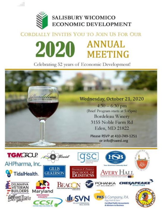
SWED held its 52<sup>nd</sup> Annual Meeting at Bordeleau