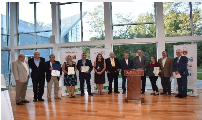
SWED 50 th Annual Meeting at the Ward Museum

At SWED, we celebrated our 50 th year of operations at the Ward Museum and featured past presidents of our organization and an ongoing display of SWED projects over five decades.