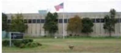
The former 66,000 s.f. Silverton facility.

The LLC plans to renovate the facility for medical product manufacturing and lease to Trinity Sterile, a growing employer in Northwood Industrial Park. The project is expected to add sixty new jobs over the next several years.