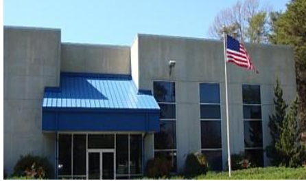
The former 40,000 s.f. Americhem facility.

As a result of the transaction, Trinity anticipates adding sixty new jobs to its existing base of one hundred associates over the next couple of years.