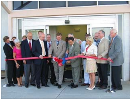
Local officials dedicate the former Airport Terminal Building as a Business Incubator

During this fiscal year, a long term goal of SWED came to fruition with the renovation of the former Airport Terminal Building into a small business incubator. Spearheaded by SWED with strong support from the Wicomico County Council, the Wicomico County Airport Commission, Maryland's Department of Business and