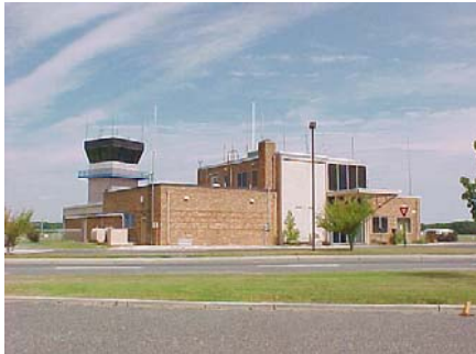
The former Airport Terminal Building

Also at the airport, SWED continued its pursuit of establishing a "business incubator" in the former airport terminal building. The goal is to provide relatively inexpensive space with flexible lease terms to new, expanding and technology-oriented companies. During this fiscal year, SWED, along