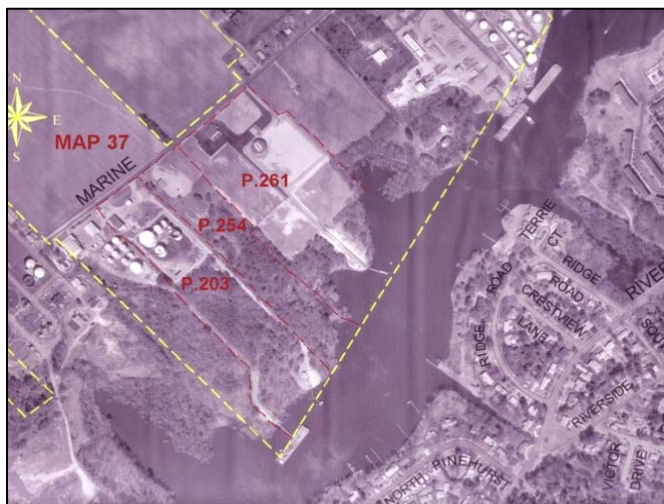
Silverton Marine recently purchased parcel 261 for a new manufacturing plant.

Also, we are pleased to announce that Silverton has acquired a twenty-acre site along Marine Road in Salisbury for a new boat manufacturing plant. The company acquired the parcel from Amerada Hess Corporation (parcel 261) and seeks to acquire an adjacent parcel of approximately ten acres (parcel 254) as well. Silverton plans to construct a new facility to manufacture fifty-three