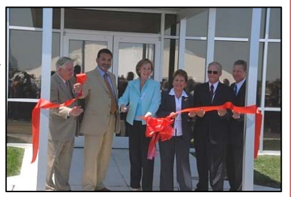
Combined, both companies invested millions of dollars in plant, property and

Manufacturing (HCM). MaTech completed its purchase and renovation of the former 150,000 s.f. Sealy furniture plant in Northwood Industrial Park while HCM began construction on a 60,000 s.f. addition to its 100,000 s.f. plant.