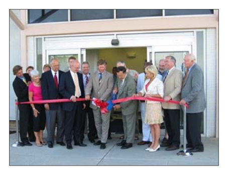
Local officials dedicate the former Airport Terminal Building as a Business Incubator

During this fiscal year, a long term goal of SWED came to fruition with the renovation of the former Airport Terminal Building into a small business incubator. Spearheaded by SWED with strong support from the Wicomico County Council, the Wicomico County Airport Commission, Maryland's Department of Business and