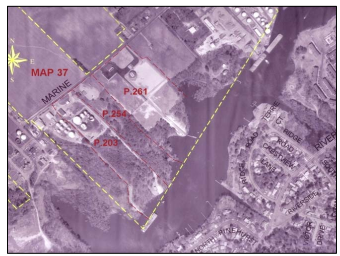
Silverton Marine recently purchased parcel 261 for a new manufacturing plant.

Also, we are pleased to announce that Silverton has acquired a twenty-acre site along Marine Road in Salisbury for a new boat manufacturing plant. The company acquired the parcel from Amerada Hess Corporation (parcel 261) and seeks to acquire an adjacent parcel of approximately ten acres (parcel 254) as well. Silverton plans to construct a new facility to manufacture fifty-three