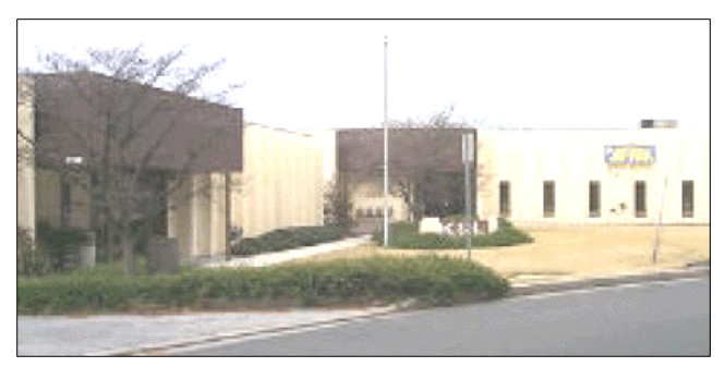
K&L Microwave's facility at Coles Circle.

1976 – 1977 K&L Microwave triples its manufacturing space to 16,000 sq. ft. Roadway and AAA Trucking locate terminals in Salisbury. SWED institutes a monthly newsletter, conducts a