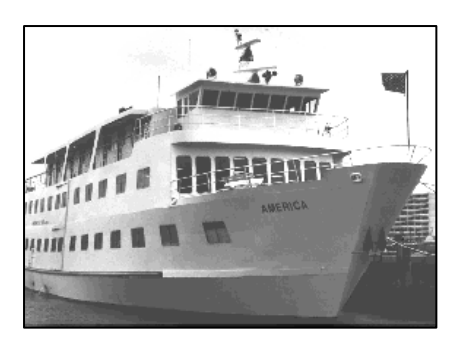
The "America", one of the first cruise ships built in Salisbury.

Chesapeake Shipbuilding purchases Roberts Shipyard on Fitzwater Street and begins constructing the "America", a 180' cruise ship. Plymouth Tube, with headquarters in Michigan, begins construction on a 70,000 sq. ft. specialty tubing plant in Northwood. The CPI percentage change from 1979–1980 is 13.5%.