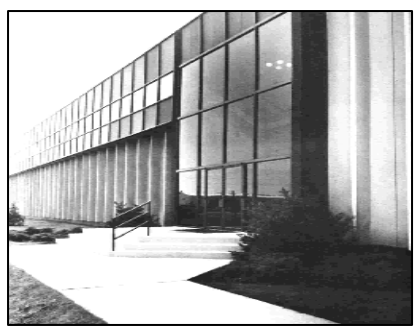
The Standard Register plant in the Northwood Industrial Park.

Standard Register purchases Burroughs Corporation's business forms division, while Mardelva News begins plant construction in Northwood. SWED received local and state approval for funds to construct a 79,696 sq. ft. inventory building.