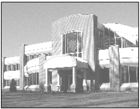
Filtronic Comtek's U.S. headquarters.

Filtronic Comtek moves into its new 80,000 sq. ft. U.S. manufacturing plant and headquarters and now employs over one hundred fifty personnel. Shoreland Freezers, Tishcon, and Trinity Labs commit millions of dollars for new